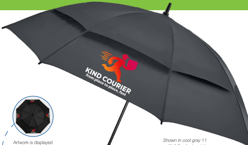
Shown in cool gray 11 with full-color imprint (1 location)

Promo pricing is only available for item numbers listed on this flyer. Inventory limited to stock on hand.