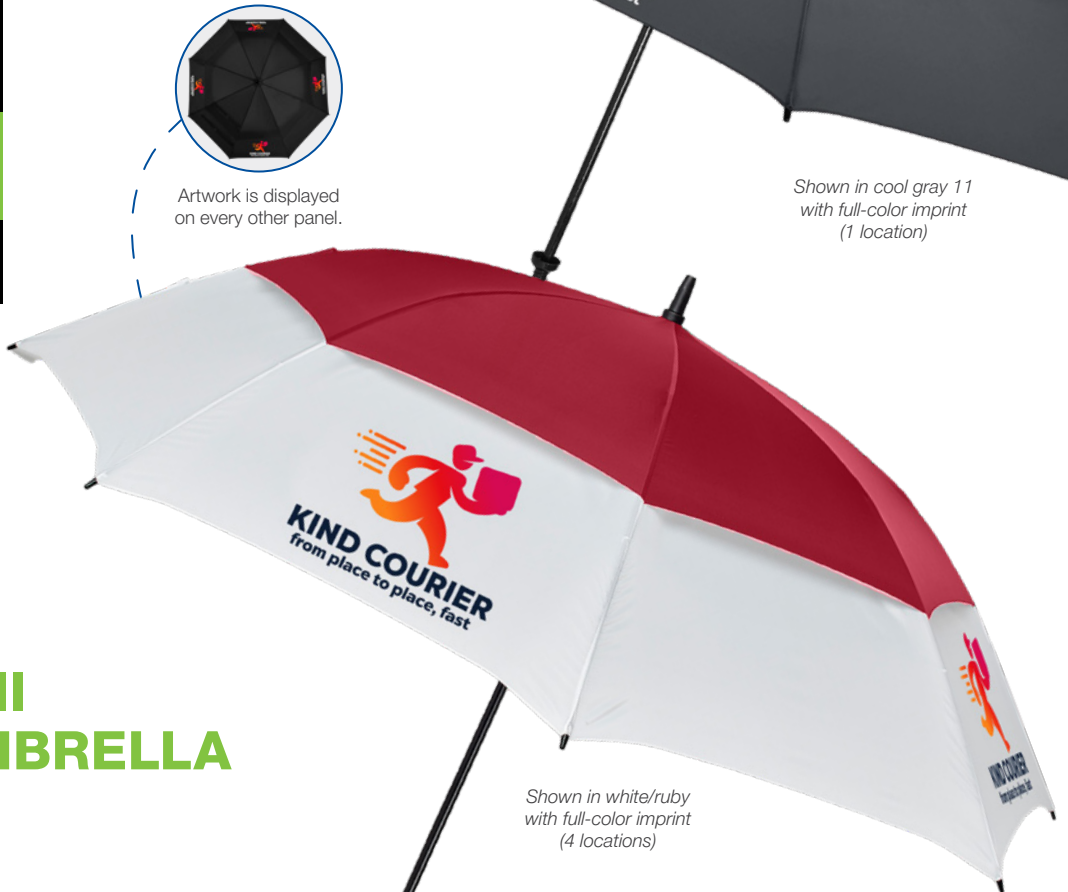
Shown in white/ruby with full-color imprint (4 locations)