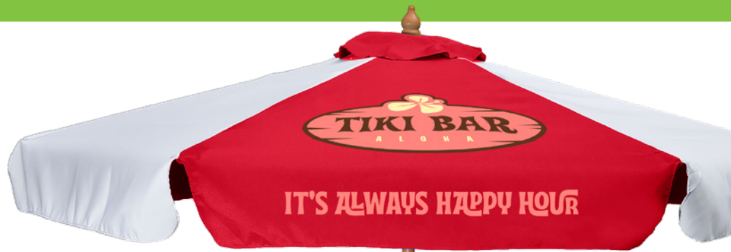
Shown in white/crimson with full-color imprint (2 locations)