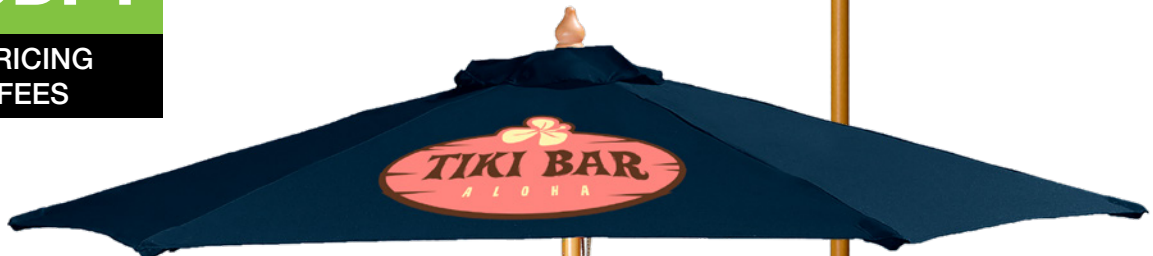
Shown in midnight with full-color imprint (1 location)